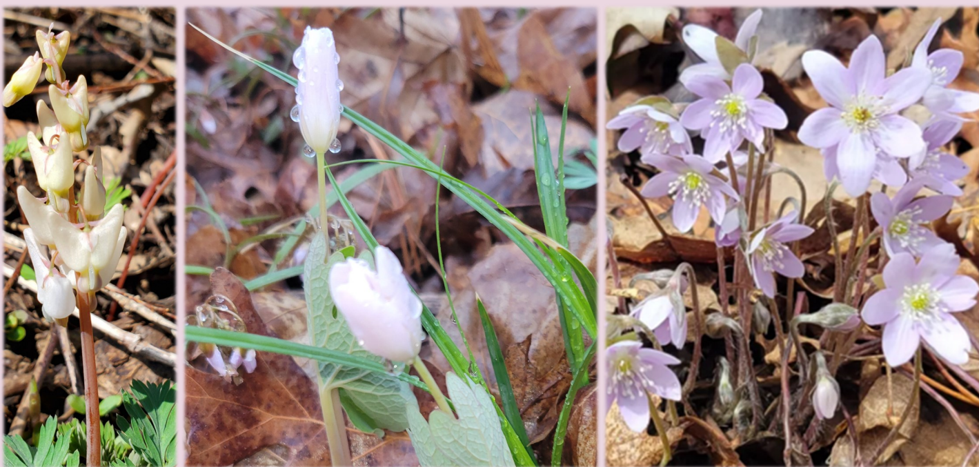
Pictured above from left to right are: Dutchman's breeches, bloodroot, and hepatica.

These early bloomers have specialized adaptations that allow them to survive temperatures into freezing and take advantage of conditions when many other plants are dormant. Some species such as hepatica have hairy stems that allow them to trap air near their stems as insulation against the cold and as a shield against frost. Bloodroot use a large leaf to accomplish a similar goal by wrapping around and ‘hugging’ the growing bud and flower.